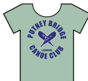
PUT Putney Bridge