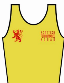
SPS Scottish Performance Squad