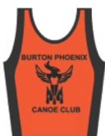
BPR Burton Phoenix