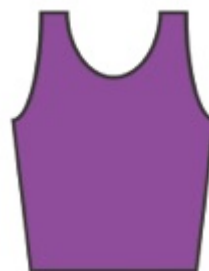
ERN Erne Paddlers