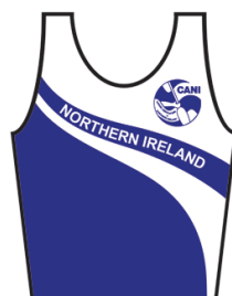
CNI Canoe N. Ireland