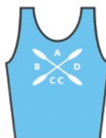
BAD Barking & Dagenham