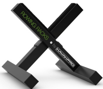
TALL BOAT STANDS