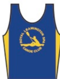
RLS Royal Leamington Spa