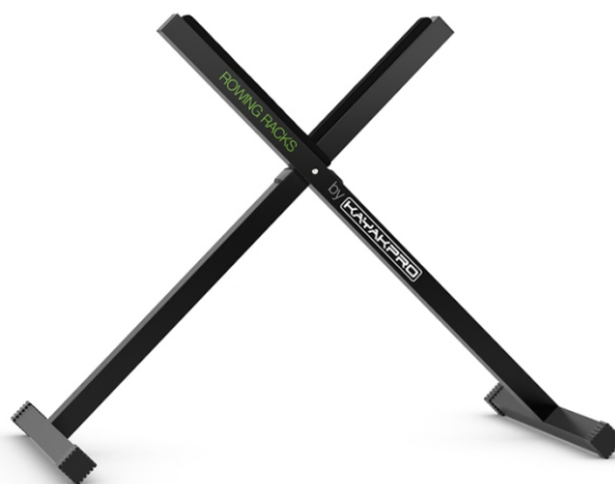
SMALL BOAT STANDS