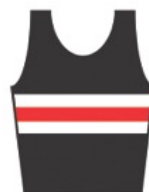
BOA Bradford on Avon