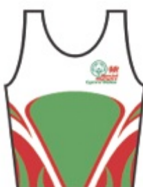
SOW Special Olympics Wales