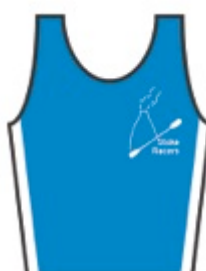
STO Stoke Racers