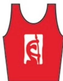
OSC Ocean Sports Club