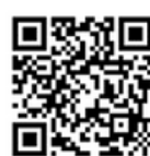
Norwich Canoe Club