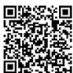
UEA Sport Scholarship Scheme

For more information on our sport scholarship scheme, course available at UEA and Norwich Canoe Club please scan the QR codes below or if you have any queries email performance.sport@uea.ac.uk .