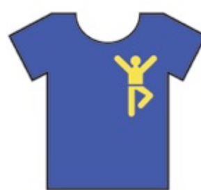
BEJ Bourne End Juniors