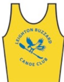
LBZ Leighton Buzzard