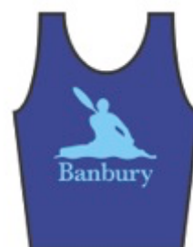
BAN Banbury & District